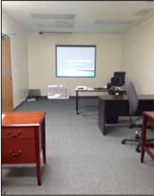
One of Several Training Rooms