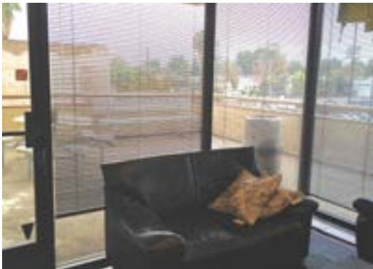
Private Second Floor Patio/Balcony