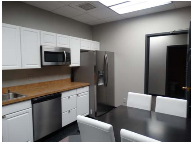
Kitchen – First Level