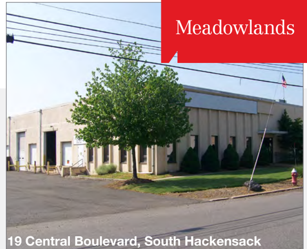
19 Central Boulevard, South Hackensack

235 Moonachie Road in Moonachie sold from Estiluz, Inc. to GGM Investments LLC for $3,450,000 or $165.22 per square foot. The 20,881 square foot industrial property was represented by NAI Hanson.